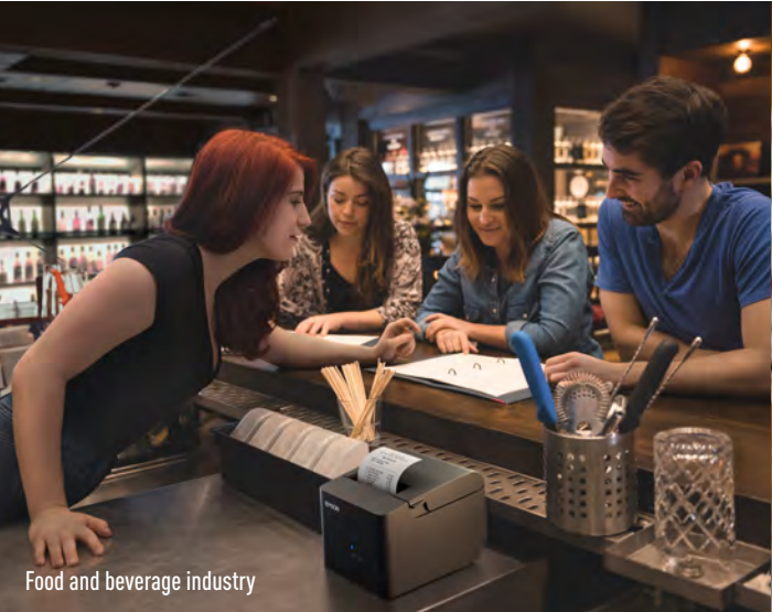
Food and beverage industry