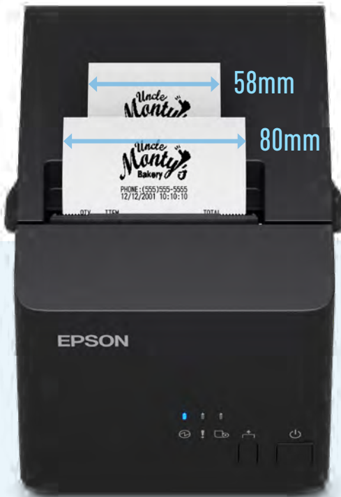
Paper width compatibility depends on selected SKU (58mm or 80mm).