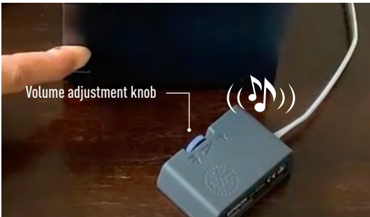
Epson Optional External Buzzer OT-BZ20

The TM-T82X-II is compatible with the optional external buzzer OT-BZ20, offering clear order notification alerts ideal for noisy environments. With this addition, businesses can ensure that orders are easily heard, improving efficiency and minimising the risk of missed notifications.