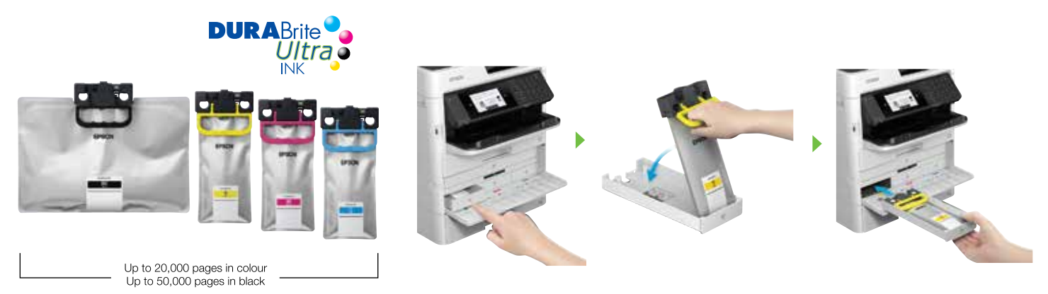
Enjoy greater cost-savings with these high-volume ink packs

In addition, Epson's DURABrite™ Ultra ink delivers laser-like quality prints that are water-, fade- and smudge-resistant.