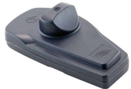
IDTM2220 9kG - New Tag Medium Gray