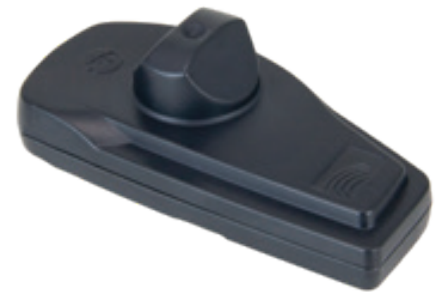
IDTM2225 5kG - New Tag Charcoal