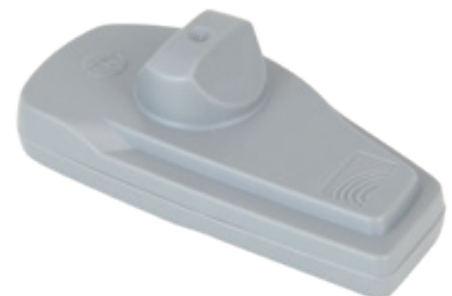
IDTM2220N 9kG - In-Store Use Tag Light Gray IDTM2225N 5kG - In-Store Use Tag Light Gray